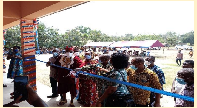
Commissioning of 6-unit classroom block 1