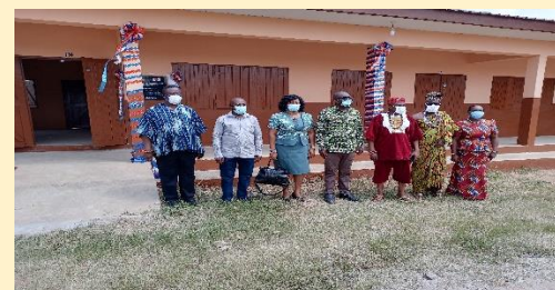
A Commissioning of 6-unit classroom block at Sogakope