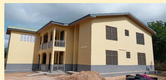
B Doctors' Bungalow at Richard Novati Catholic Hospital