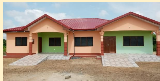
CHPS Compound at Dalive Torzikipota

Public health programmes, gender empowerment programmes, public education programmes, official celebrations, justice delivery and legal services, manpower and skills development, supervision and inspection of education delivery, youth, sports and culture programmes, malaria prevention and HIV programmes, environmental sanitation services, solid and liquid waste management, agricultural extensions, street naming and property addressing, social intervention programmes, child rights promotion and protection, natural resource conservation, disaster prevention and management programmes, etc.