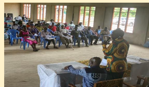
C Town hall meeting at Larve