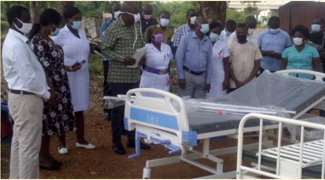
Donation of Medical Equipment to Health facilities