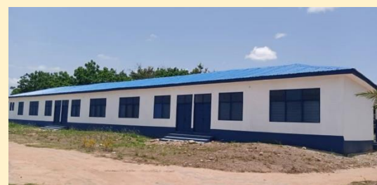
4 Unit Classroom Block for Dabala SHTS